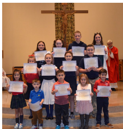
Congratulations to our Christian Witness Recipients for the month of October. May you continue to be "...visible examples of Gospel living."

Donations of wrapping supplies are being collected in the main office.